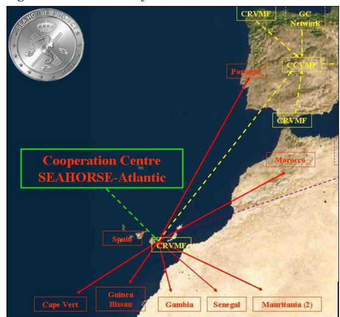
Figure 1. Visualisation of the 'SEAHORSE' network